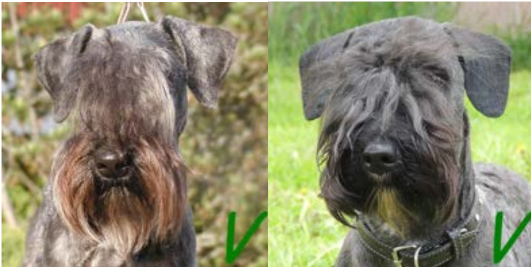
Acceptable ears (left: diverted point, right: lower set+slightly rounded point)