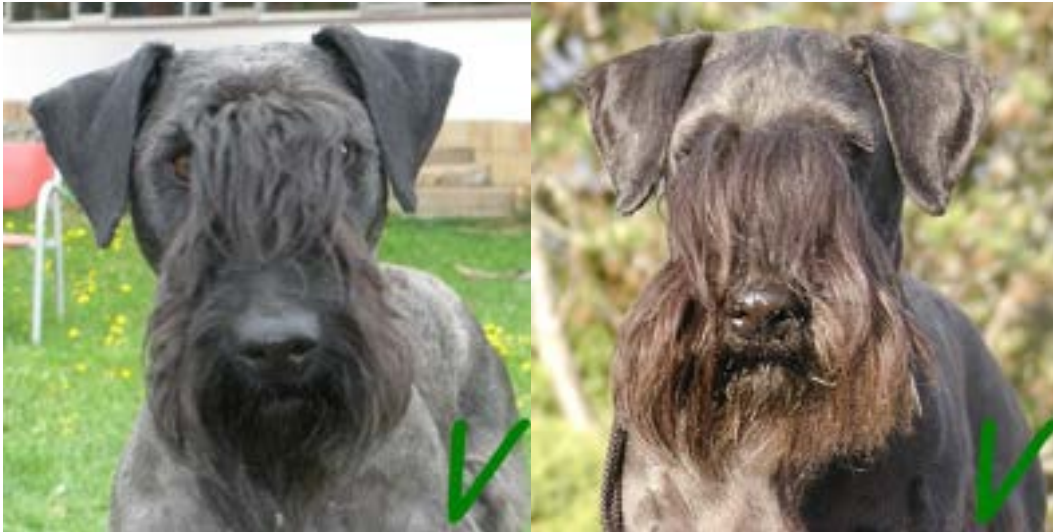
Correct ears (almost fully ) closed to the cheeks.