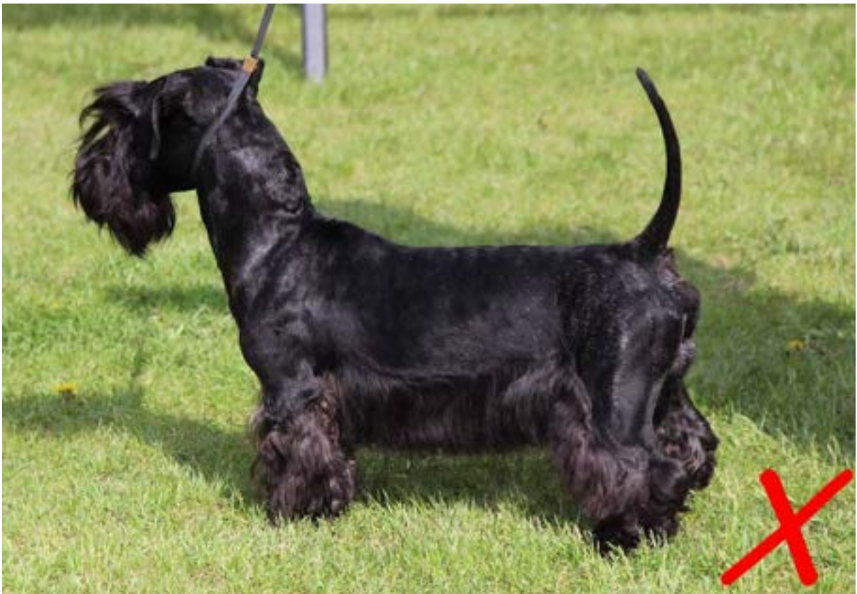
Not correct, too flat topline with a short croupe and a (not correct) high tailset.