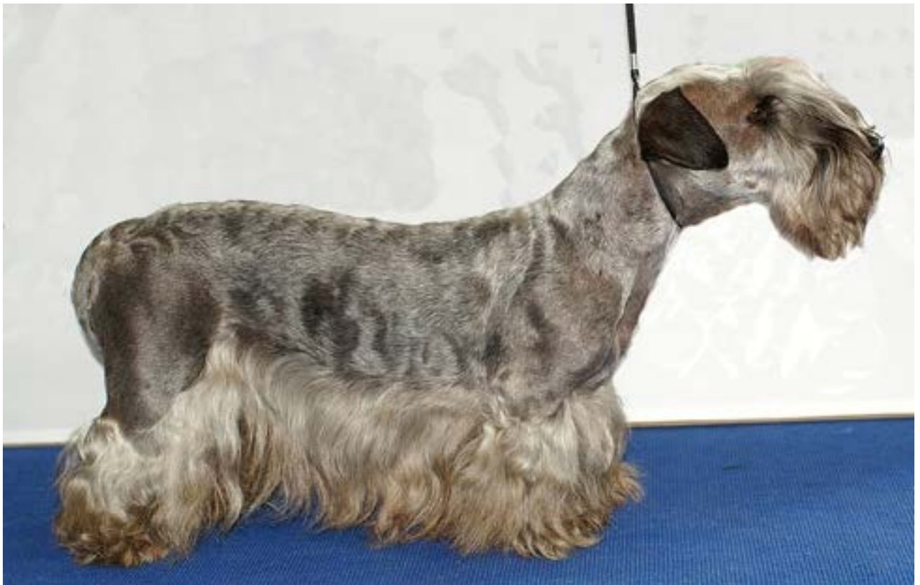
An excellent adult female, showing correct body construction and topline.

The arch over de loins develops with the age, so do not penalize the youngest puppies for rather flat topline. The arch is often more explicit in the females.