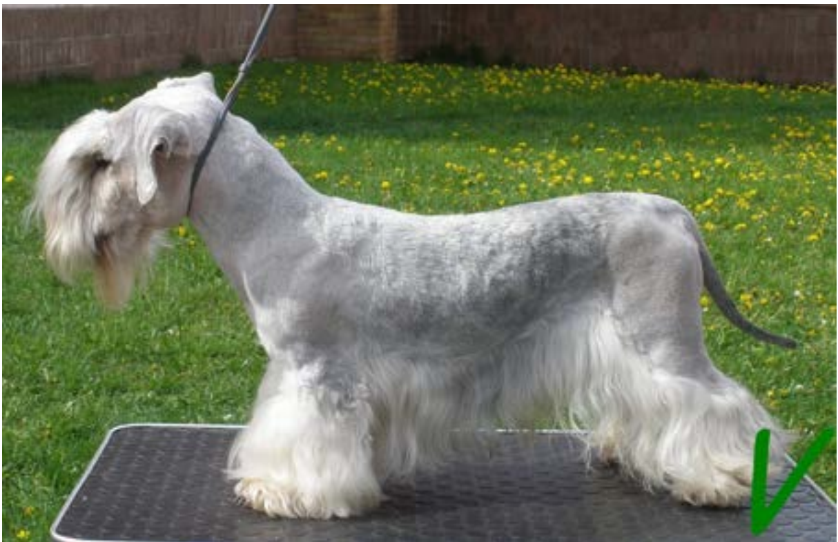
Acceptable topline in an adult male. The arch over the loins could be more pronounced.