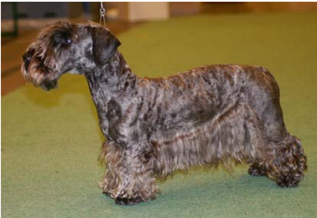
Brindle coat, acceptable in a young Cesky Terrier, mostly not visible in an adult dog any more. Please, pay attention to this colour as the genetic basis is incorrcet brindle colour.