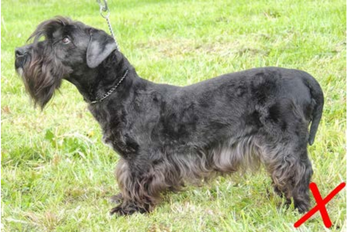
Not correct, rising topline, caused by steep rear angulation.