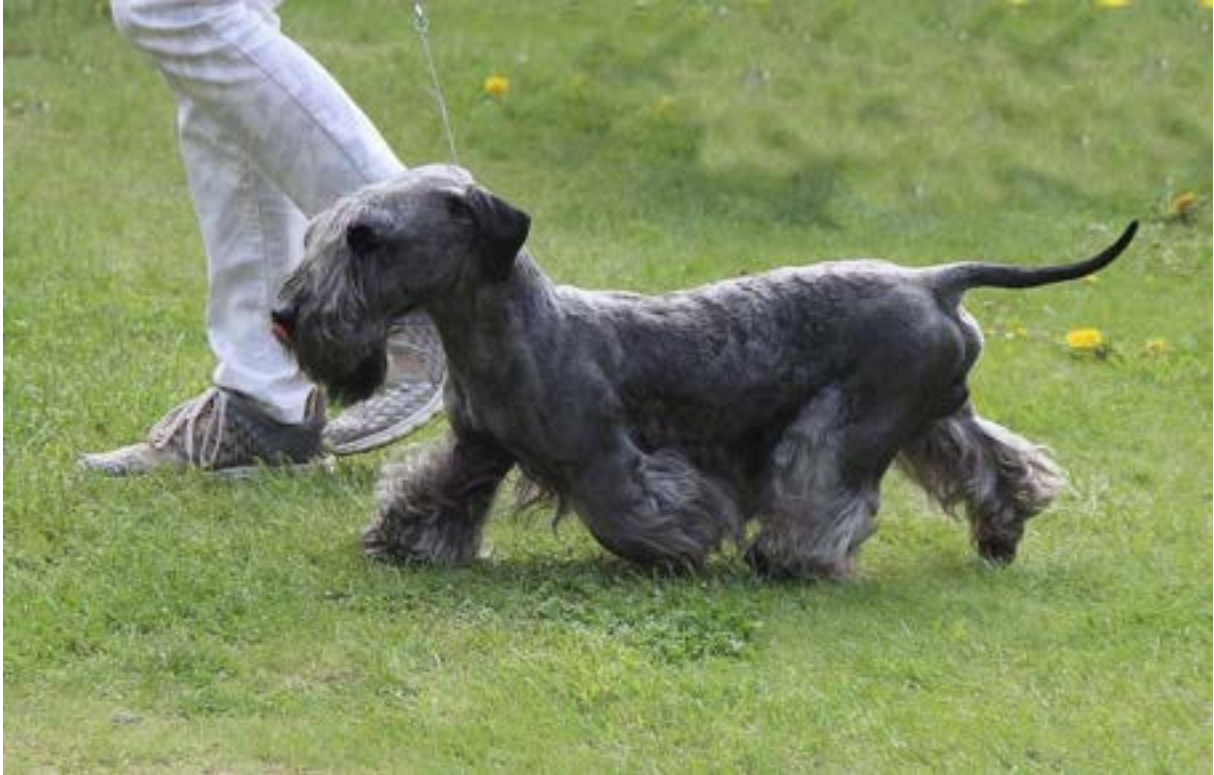
Correct tailset and tailcarriage at movement.