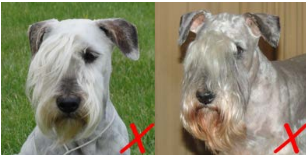
Not correct ears (left: wrong folded; right: too light+ open)