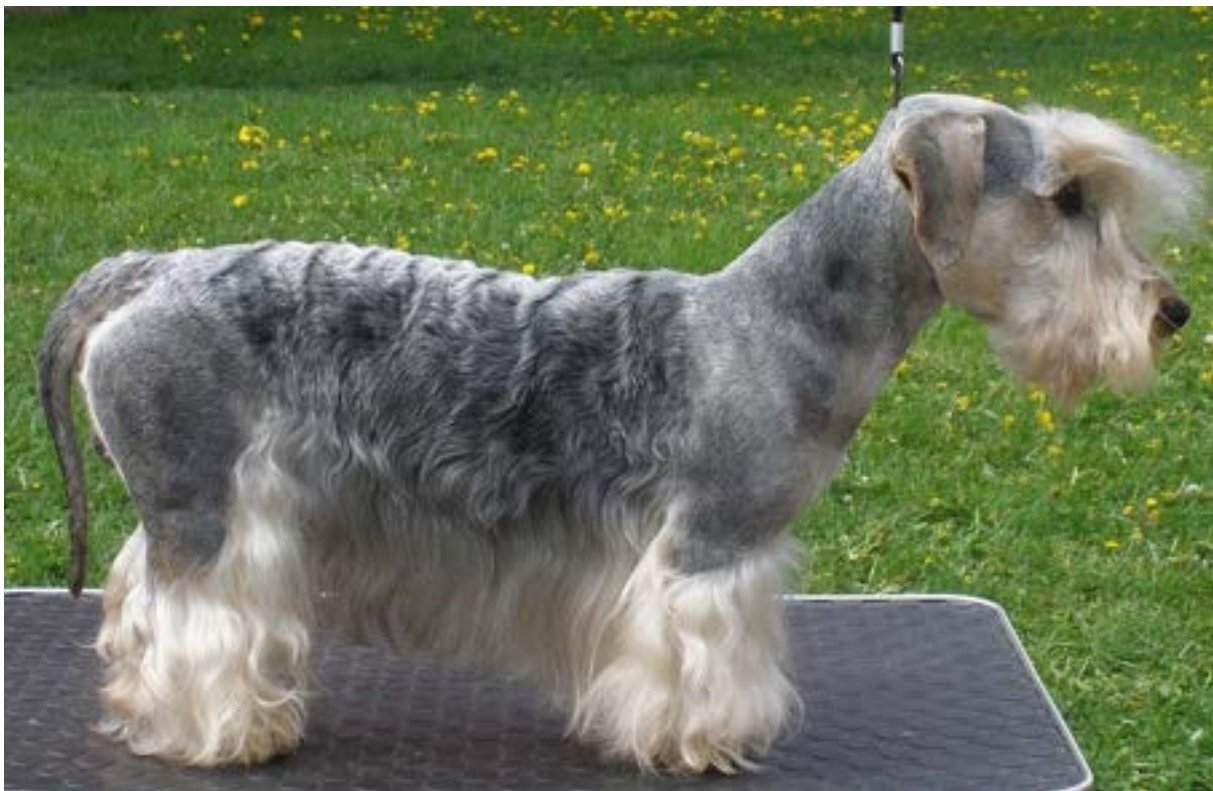
Correct blue&cream colour. Also this high quality male has no white hair.