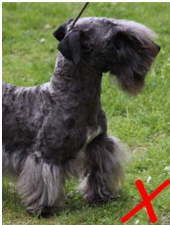
Incorrect fronts: left crooked legs, too close in pasterns, waek feet indicated by too long nails; right wide front with a short, upright upper arm and out at elbows.