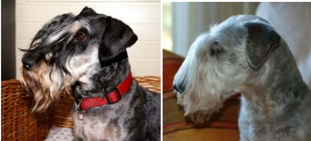
Two litter-sisters, both born as a black&tan, the left one in dark-grey shade, the right one pale. Both these Cesky Terriers are of correct colour and have no one white hair!