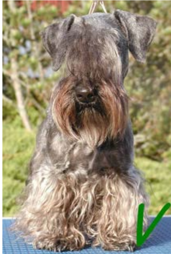
Correct fronts: not too wide (not more than one handpalm) and as straight as possible. Feet pointing forwards.