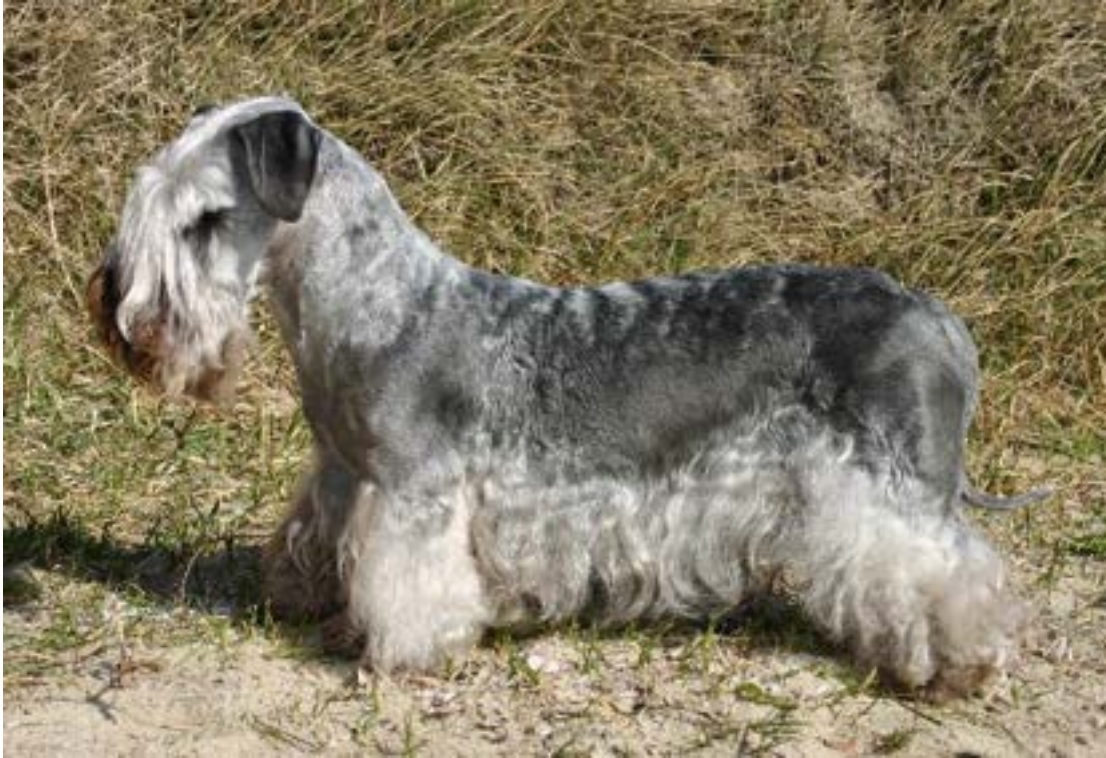
Excellent medium grey colour with light grey furnishings (this is not a white colour as the skin is fully pigmented!) and typical dark, almost black ears. Note the typical topline in this 11-years old female.