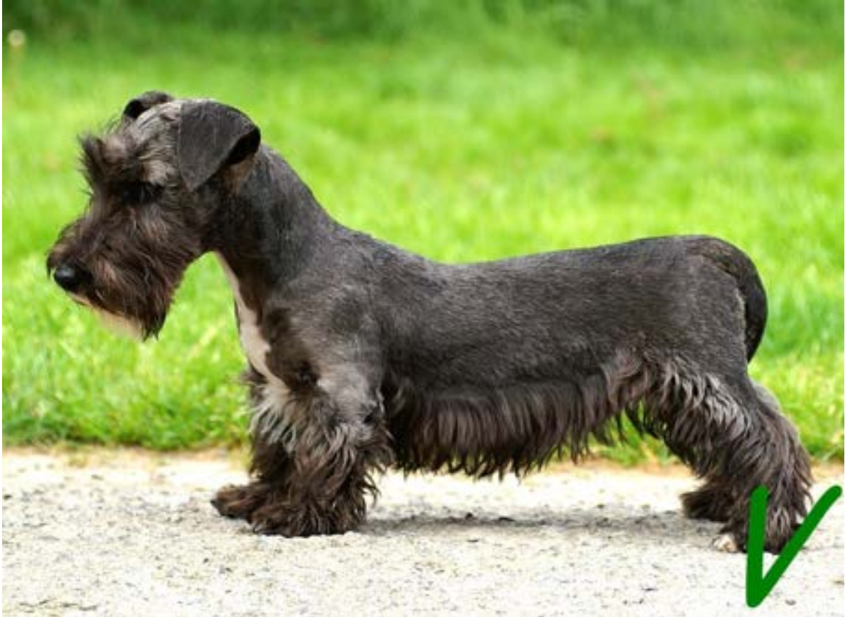
Acceptable topline in a 4 months old puppy. The development is not finished yet.