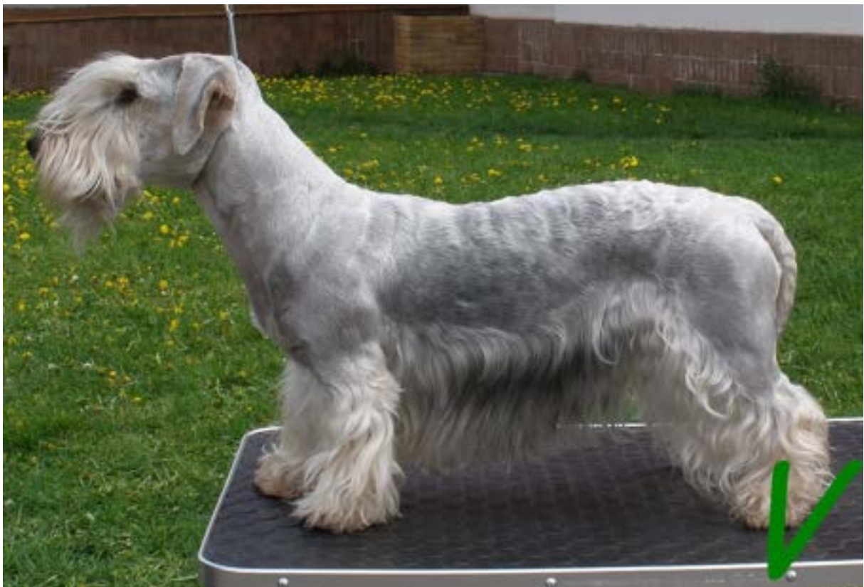
Correct topline in a female. Note also the correct blue & cream colour.