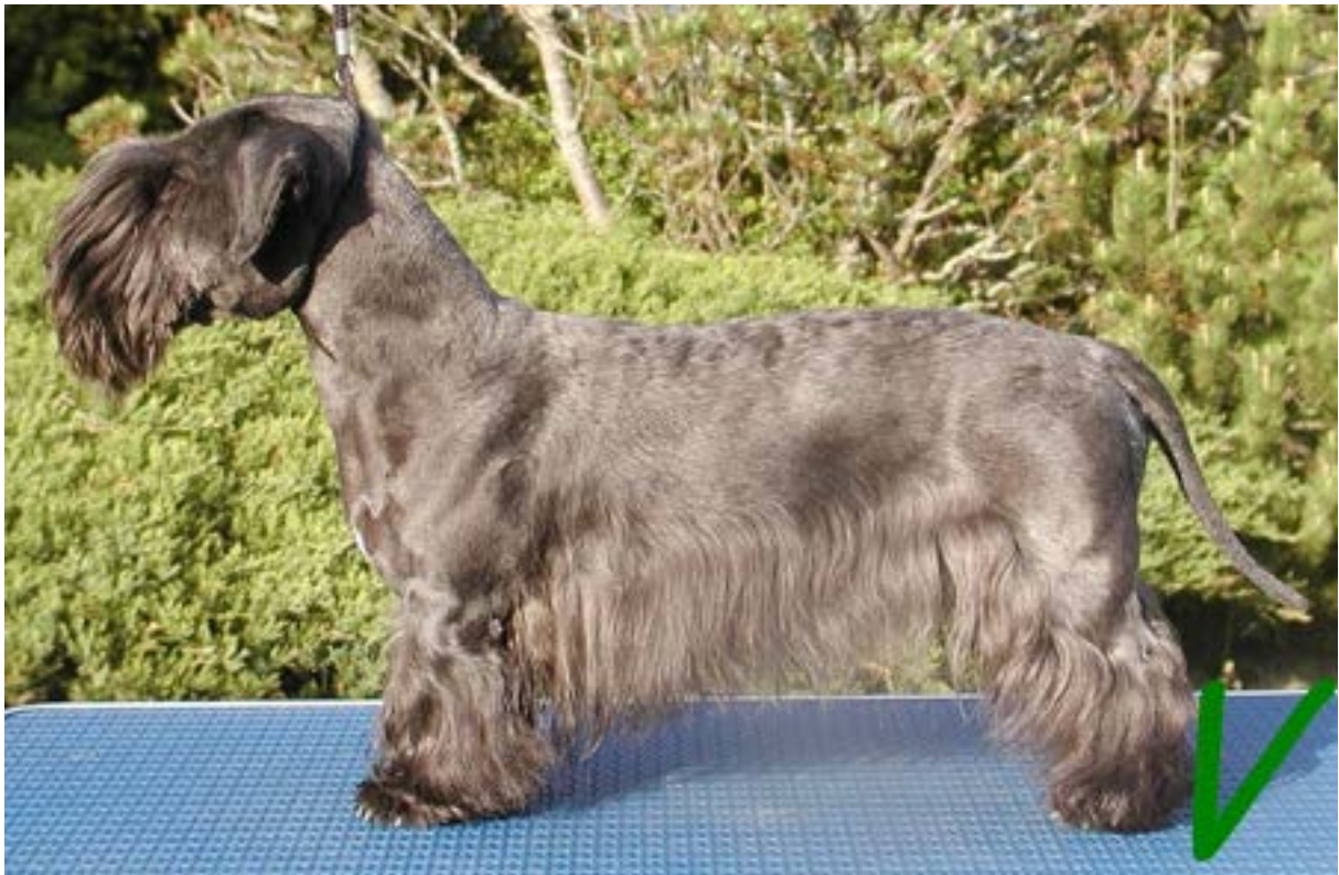
Correct topline in a male.