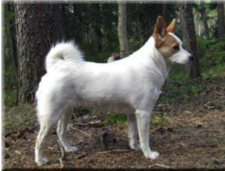
Colour on head only.