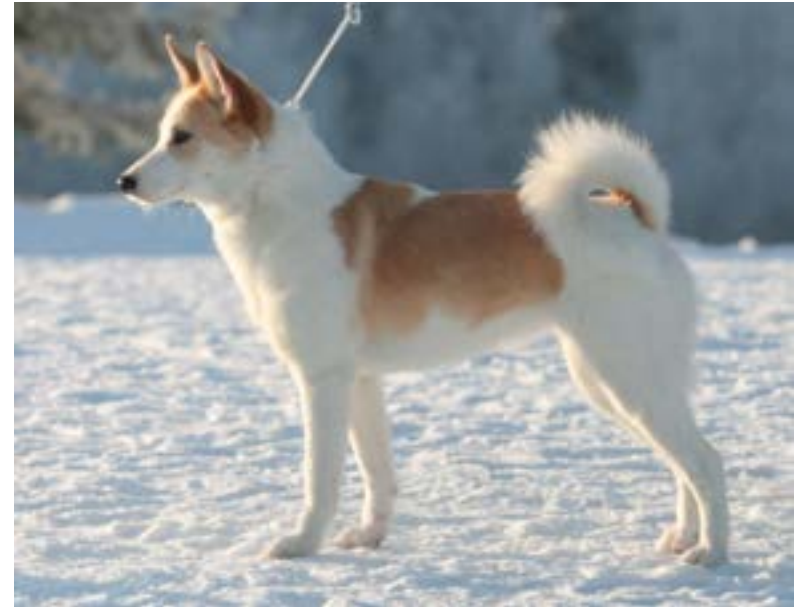
Female of excellent type