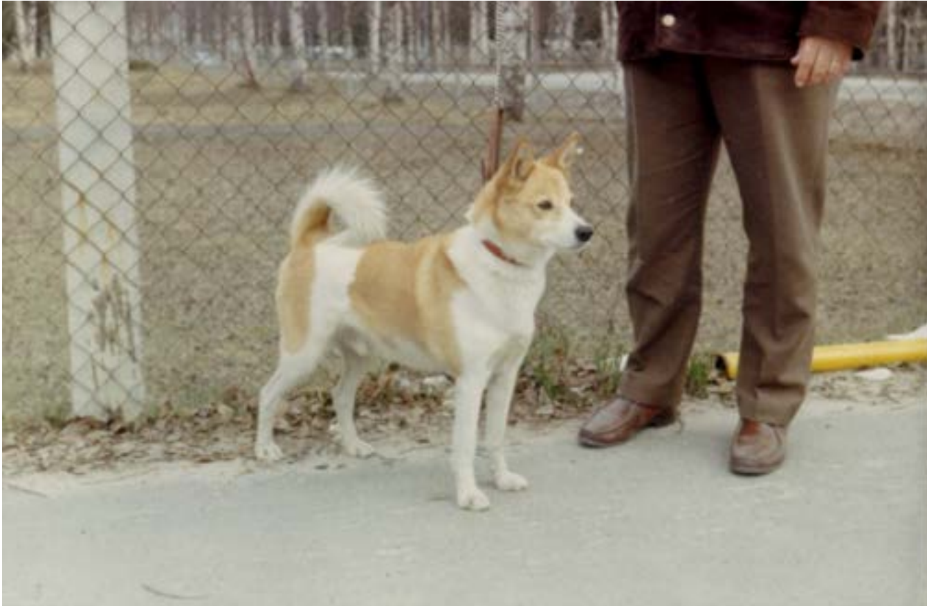
Male from around the 1970's.