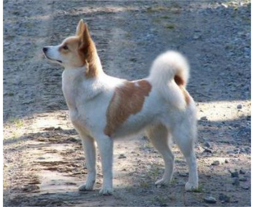
An excellent female