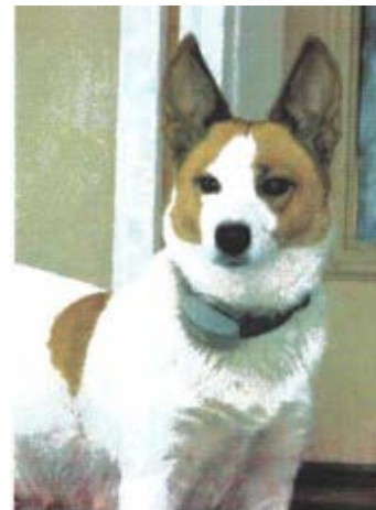
Way too big ears.