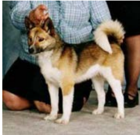
Not correctly distributed patches. Fawn colour.