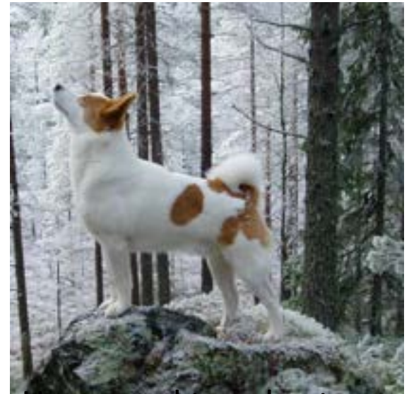
Heavy and too short legged male.