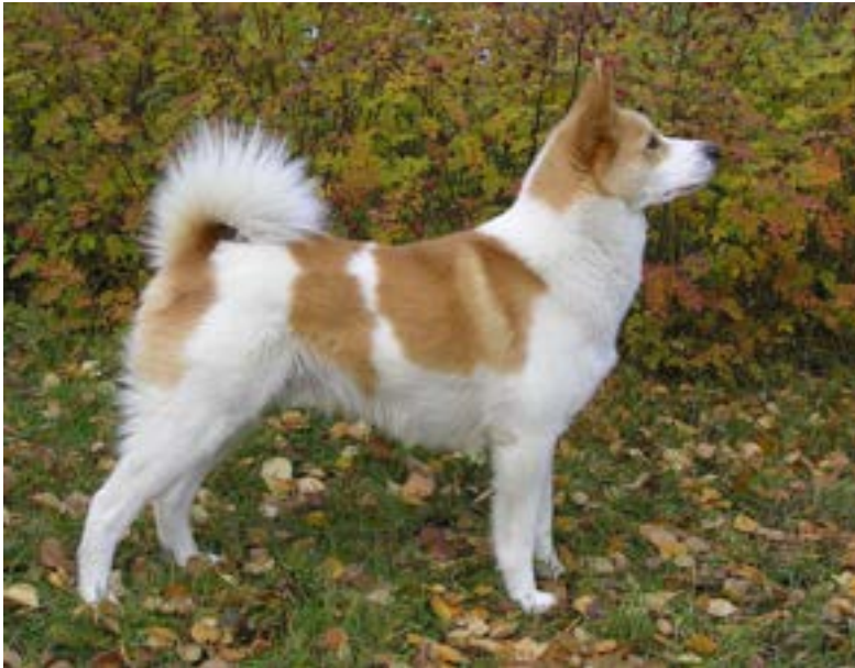
Male of excellent type