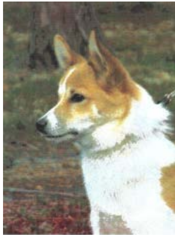
Big forward tilted ears.