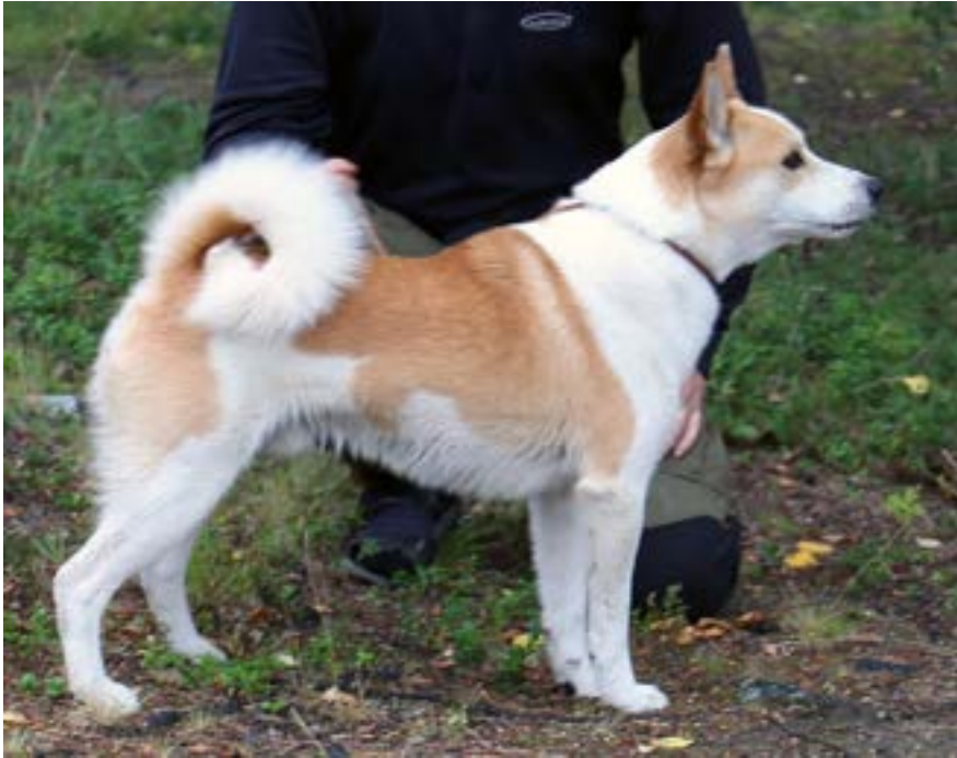
An excellent male