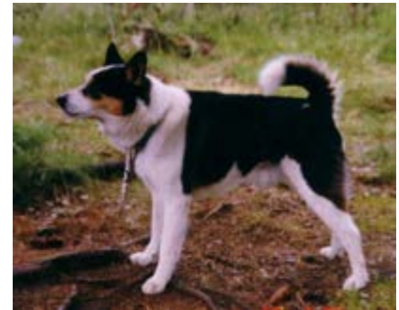
Not correctly distributed patches, black colour and also tan markings (severe fault).