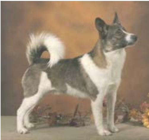
Not correctly distributed patches. Agouti colour.