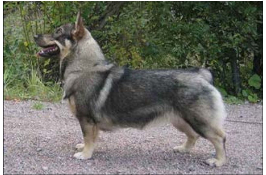
Female of excellent type