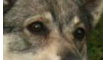
Too round eyes