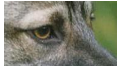
Too light eyes (wolf-like)