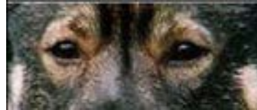
Excellent shape and colour