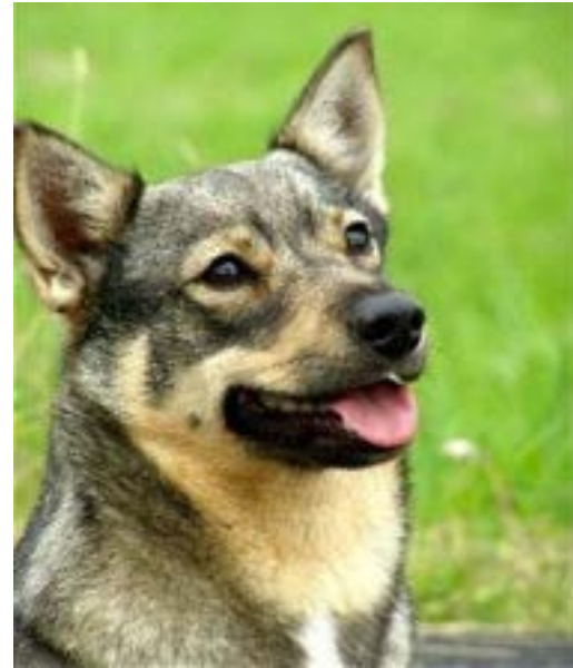
Excellent female head