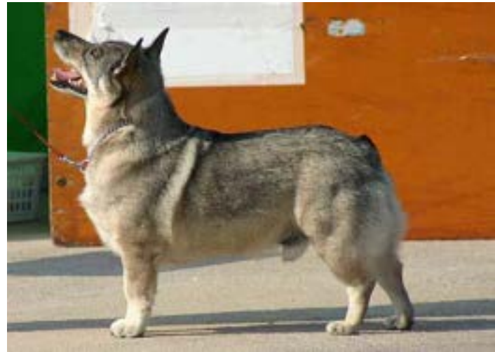
Grey male, a bit short in back and too round and steep in croup.