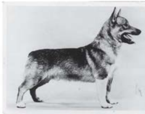
A male from the 1960's