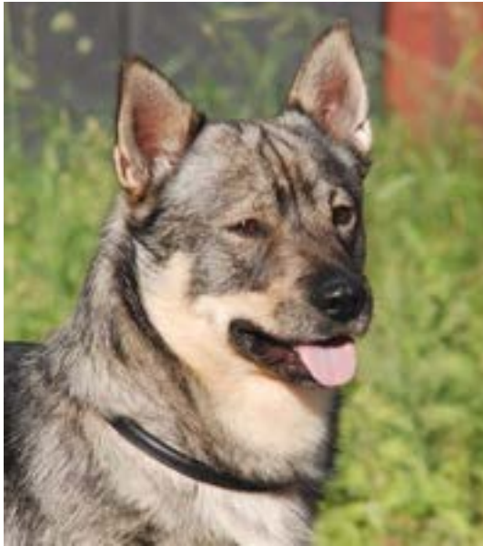
An excellent male head. Could have slightly less wrinkles.