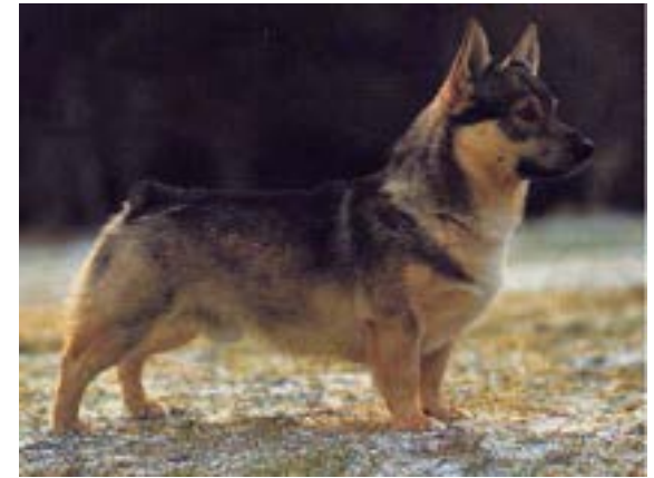
A male from the 1970's (who could still win today)