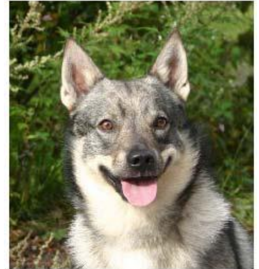
Light and round eyes gives the wrong expression

Be aware of eyes too round and protruding or eyes obliquely placed or placed too narrow, which will spoil the expression.