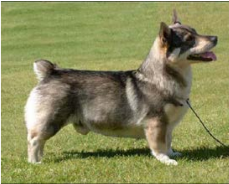
Male of excellent type