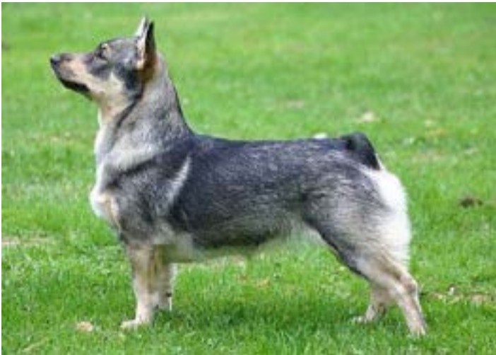
Grey female with an excellent back.