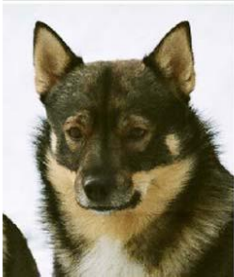
Excellent eyes and expression

Eyes should be of medium size, oval in shape and dark brown.