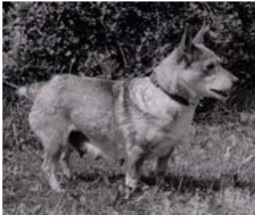
The first brood bitch "Vivi", born around 1935