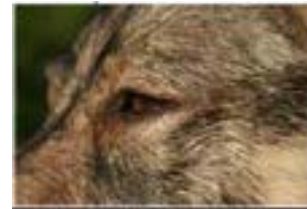
Obliquely placed eyes give a hard expression